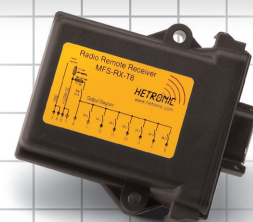
MFSHL RX-T8 Receiver